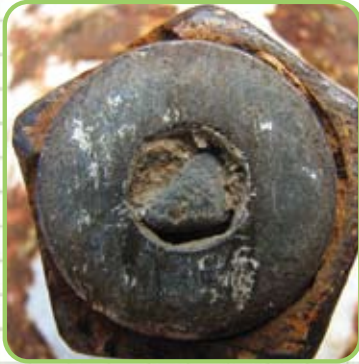
Typical Old Nut

Existing adjustable hydrant wrenches exist, but they do not fully engage the nuts. They require a hand screwing action to adjust and lock down on to the hydrant nut.