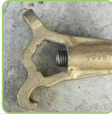
Current Adjustable Wrench Style