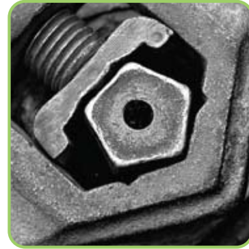
Current Adjustable Wrench On Nut

(Place on nut. Turn 7-8 times to reach correct size. Remove work.)