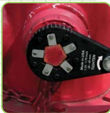
Bionic Hydrant Wrench™ On Nut

A High Performing Solution When Speed and Function Count the Most